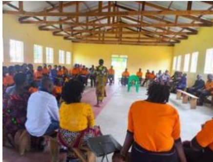
Business Management Trainings