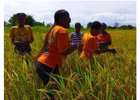
Rice Farming with Mbeya Manure