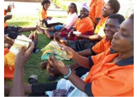
Village Savings and Loan Group