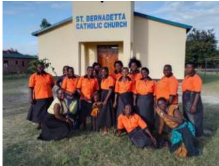
St. Bernadette Outstation Bible Sharing