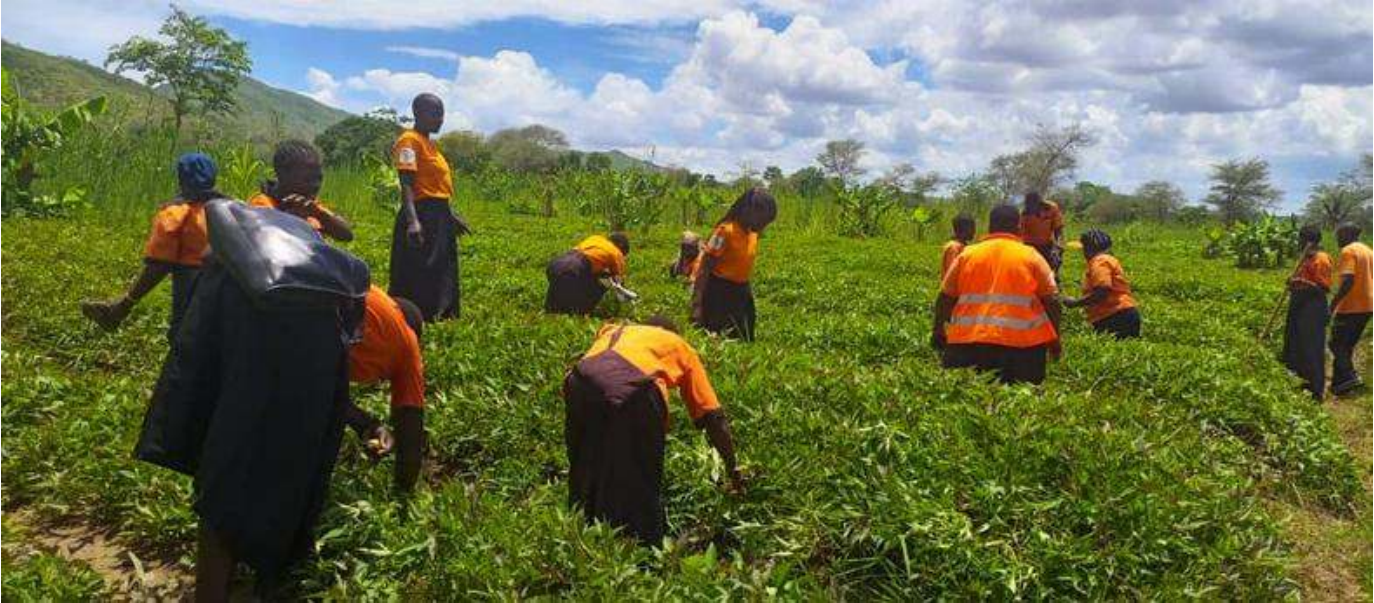
Kolping Members from St. John Paul II working in their sweet potato vine field

The Kolping family from the St. John Paul 2 outstation in Chitipa has made progress in the seed multiplication of sweet potato vines, showcasing an inspiring model of agricultural entrepreneurship. Trained by the Kolping Society of Malawi, this family has embarked on a venture that not only enhances their livelihood but also supports local farmers by providing them with quality sweet potato vines.